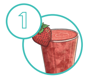
Walk to meet a friend for a drink or local activity.